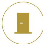
TEAK MAIN DOOR