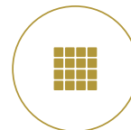
ISPIRA 4'X2' TILES