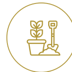
GARDEN SIT OUT