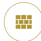
9" EXTERIOR WALL