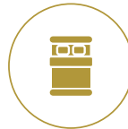
M.BED WOOD FINISH TILES