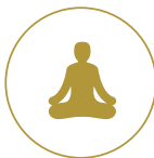
MULTI PURPOSE ROOM